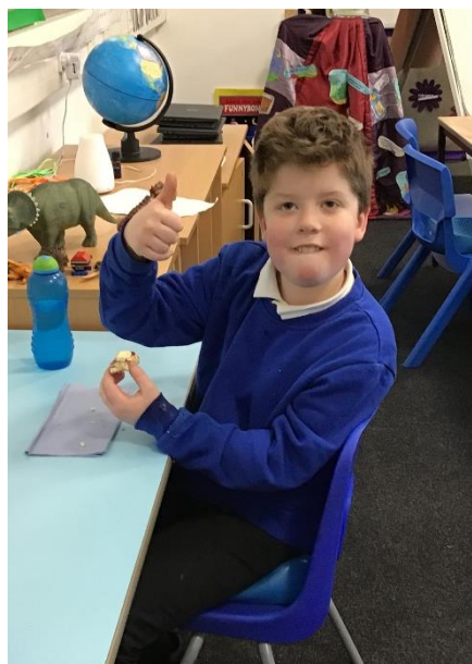
Year 3's Cream Tea Topic Launch!